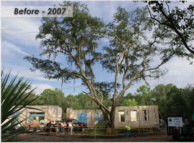
Before - 2007