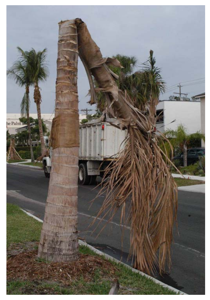
Figure 2. Cocos nucifera trunk collapsed upon itself due to Thielaviopsis trunk rot.