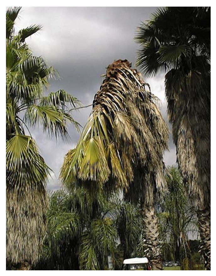
Figure 1. Washingtonia robusta with trunk collapsed on itself due to Thielaviopsis trunk rot.

"Stem bleeding" is a common symptom of Thielaviopsis trunk rot observed on Cocos nucifera (coconut). This stem bleeding is a reddish-brown stain that runs down the trunk from the point of infection (Figure 6). Since any trunk wound may result in stem bleeding, close examination of the