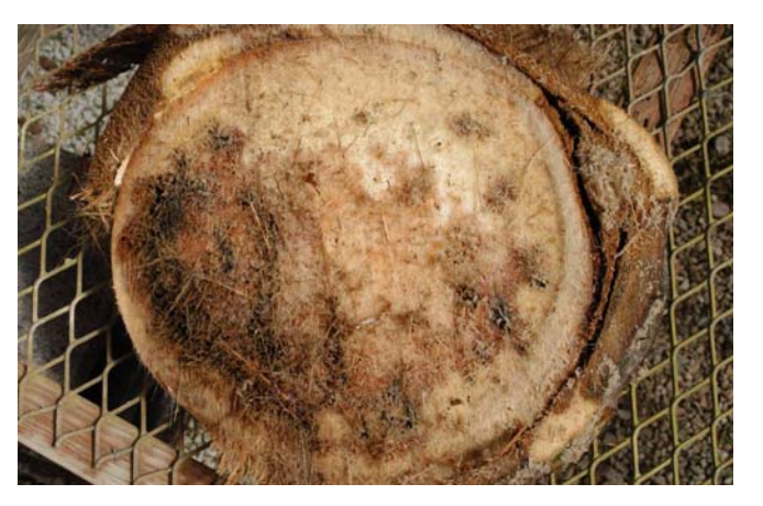
Figure 5. Cross-section of Cocos nucifera trunk illustrating that the rot caused by Thielaviopsis paradoxa occurs on only one side of the trunk and moves from the outside to the inside of the trunk.

The Florida Extension Plant Disease Clinic (FEPDC) network is available for pathogen identification. Contact your local county Extension office or FEPDC for details on sample submission and cost of the laboratory diagnosis.