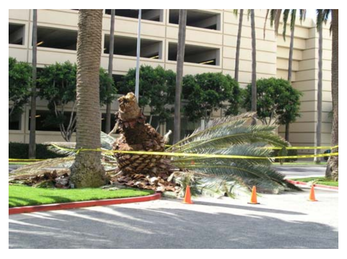
Figure 3. The canopy of this Phoenix canariensis fell off of the trunk due to Thielaviopsis trunk rot.

this endeavor. Older, rotted trunk tissue is likely to have secondary fungi and bacteria present which complicate, and sometimes prevent, the isolation of Thielaviopsis paradoxa .