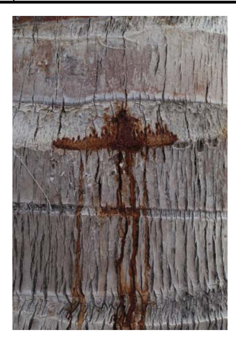
Figure 6. "Stem bleeding" on a Cocos nucifera due to infection from Thielaviopsis paradoxa .

(such as ambrosia beetles), birds (sapsuckers pounding on the trunk), rats, and other mammals can cause wounds. Blowing objects during a wind storm can strike a trunk and cause a fresh wound. Humans cause wounds with nails and climbing spikes, or during the digging and transplanting process.