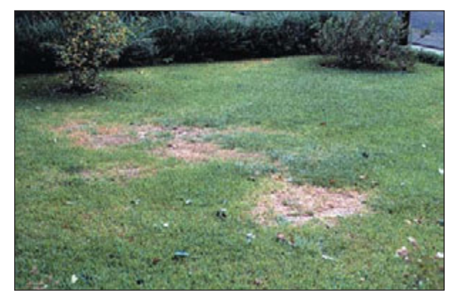
Figure 1. Irregular declining areas of take-all root rot

Take-all is a disease of the roots. Symptoms of take-all root rot usually become apparent from early spring through early summer, suggesting infection may occur during the previous fall. Initially, the affected turf becomes wilted and yellow, followed by the development of thin, bare areas as plants die. These declining areas can be irregular in shape and can vary in size from 1 foot to more than 20 feet in diameter (Figure 1). Turf can usually be pulled from the soil quite easily as a result of infection. Dark strands of mycelium (ectotrophic runner hyphae) of the fungus can develop on the roots and stolons (Figure 2), giving them a